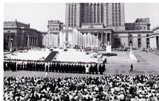
Pope John Paul II celebrates Mass at the main entrance to the Palace of Culture and Science (originally known as the Joseph Stalin's Palace of Culture and Science), Warsaw, June 14th 1987

The 8th of June 1987 marked the beginning of the third pilgrimage of John Paul II to Poland and, as it later turned out, the last to the People's Republic of Poland.